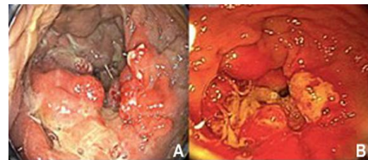
Figure 1. Colonoscopy. A sessile, elevated lesion with an infiltrative neoplastic appearance and central depression is observed in the lower rectum, 4 cm from the dentate line and affecting the first Houston valve. It involves 50% of the rectal circumference and extends longitudinally 3 cm proximally.

A 52-year-old male with chronic constipation had experienced intermittent episodes of painless rectal bleeding for the past three months. He reported no weight loss, change in bowel habits, or family history of colorectal cancer. A colonoscopy revealed an elevated, ulcerated, infiltrative-appearing lesion with a depressed center on the inferior Houston valve, involving approximately 50% of the rectal circumference. Biopsies were taken. No synchronous lesions were identified (Fig. 1A).