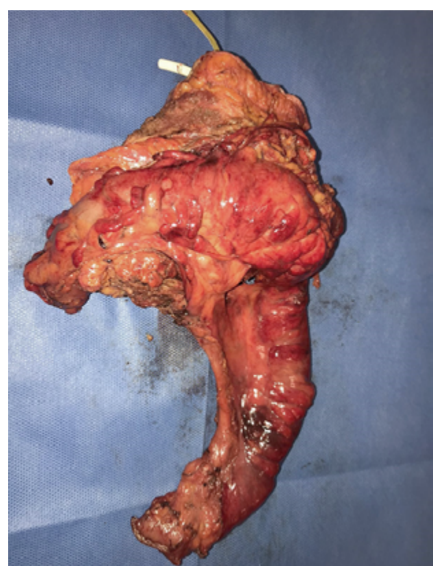
Figure 8: En bloc resection specimen of the left colon, iliac muscle and left anterolateral abdominal wall, with percutaneous drainage included to obtain an adequate oncological margin.

Campos et al.1 showed R0 resection rates of 84.4%,