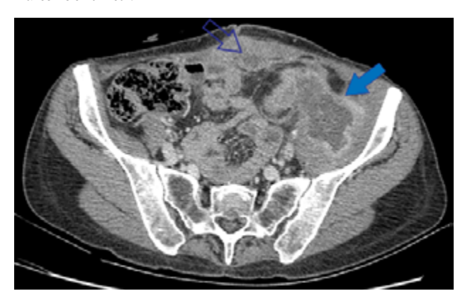
Figure 2: The thickening of the descending colon fistulized towards the left iliac muscle and with collection inside can be seen (solid arrow).b) Another small collection located below the midline (open arrow) was also included in the resection.