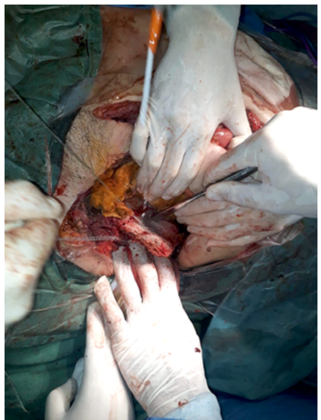
Figure 5: Resection of the left iliac crest with a Gigli saw (cephalic region on the right).

neighboring organs (T4b) are observed in 5 to 20% of patients.<sup>1</sup>