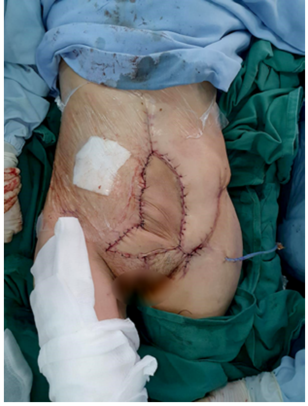
Figure 9: Reconstruction phase with rotation of an anterolateral flap from the right thigh.