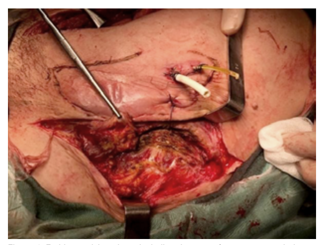
Figure 4: En bloc excision phase including the area of percutaneous drainage of the abscess (cephalic region to the right of the image).