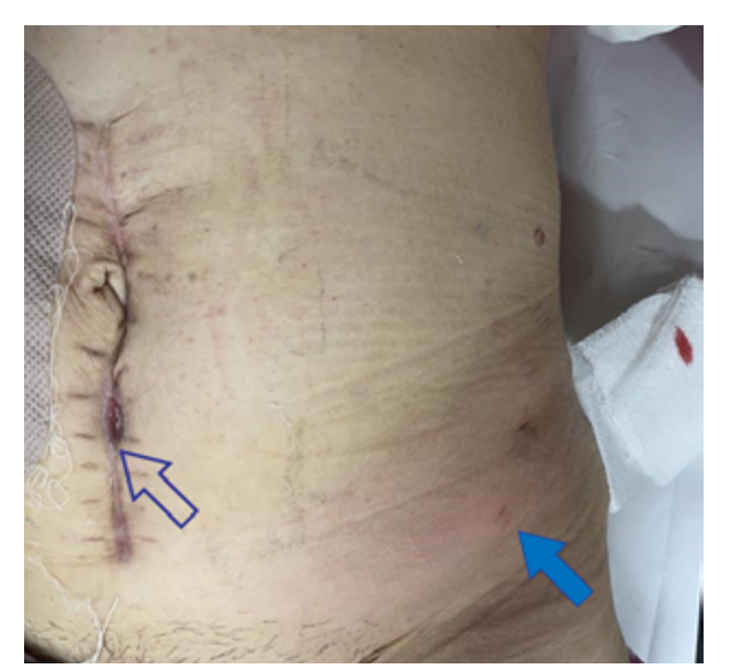
Figure 3: The inflammatory area corresponding to the skin involvement of the tumor (continuous arrow) and the fistulous orifice of the median incision scar (empty arrow) are observed.